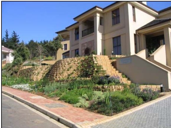
Contractor: Decorton retaining

This particular installation of Terraforce L11 rock-face blocks provides for a level, spacious platform -- about 3m above road level -- around a house built on a steeply sloping erf. To soften the walls that support the fill for this platform, various flowerbeds and steps were added into the design.