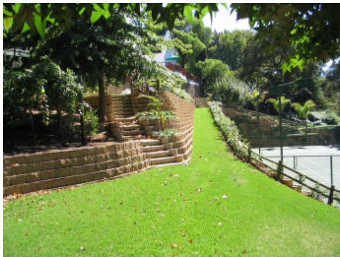
Project: La Vue Estate. Owner: Ossie Lawson. Engineer: Fred Laker

The bidding for this contract, setting high standards in terms of aesthetics, versatility and environmental compatibility was won by Decorton, one of the recommended Terraforce installers in the Western Cape. The first phase required a 2,5,m high plant supportive gravity wall below a new tennis court. Fred Laker, the engineer, specified L11 rock-face blocks with a 1.2m layer of cement stabilised sand behind. Elsewhere on site various terrace walls, up to 4.8m high were required to support a putting green and a grassed ramp leading to the main dwelling.