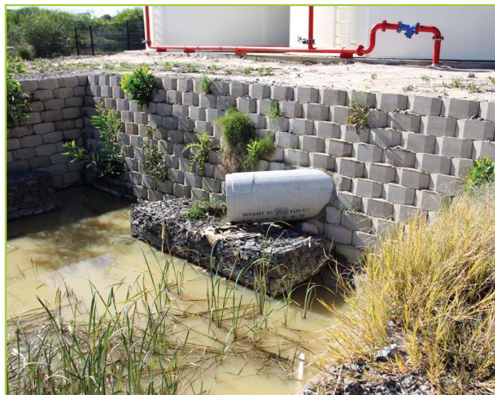
THE INLET PIPE THAT COLLECTS ALL THE WATER