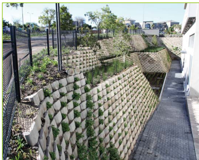
CURVES AND FEATURES CAN BE INCLUDED