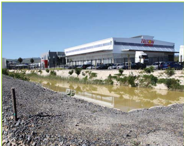
STORM WATER MANAGEMENT AT NEW DEVELOPMENT