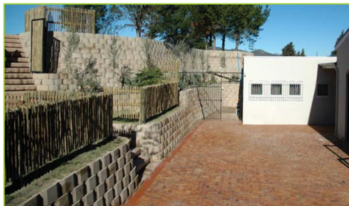
STEPS INCORPORATED WITH EASE