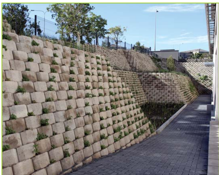
TILTED FOUNDATION FOR EXTRA STABILITY