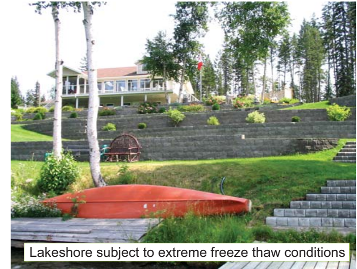
Lakeshore subject to extreme freeze thaw conditions

specifically so that it can be installed with ground anchors for application with high water velocities.