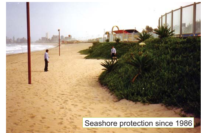
Seashore protection since 1986

Concrete Retaining Blocks: Terraforce blocks have a closed vertical surface structure (no air voids within wall). Consequently they have a high constructed mass, resist erosion of backfill