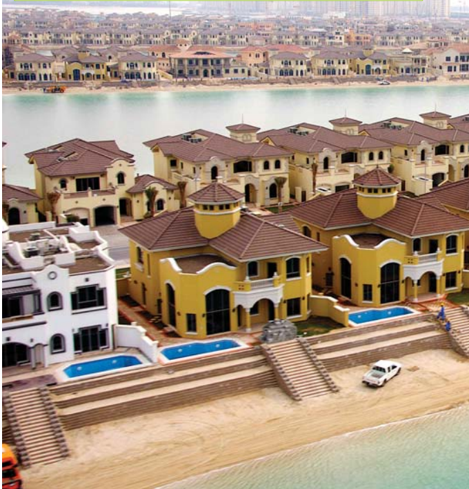
Palm Jumeirah, Dubai, seashore protection

Light small stream protection with energy dissipating weirs incorporated at regular intervals. Prevent undermining of weirs with random packed rock apron or similar.